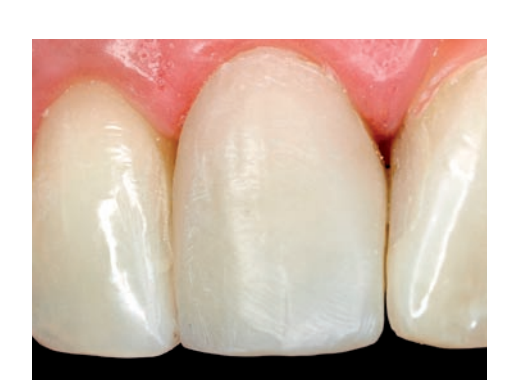
Before: Composite restorations can appear dull even after the high gloss finishing.

application, smoothes them out, seals them and leaves behind a brilliant, smooth surface without modifying the occlusion. Easy Glaze provides the adhesive interface between composite and tooth substance with long-term protection.