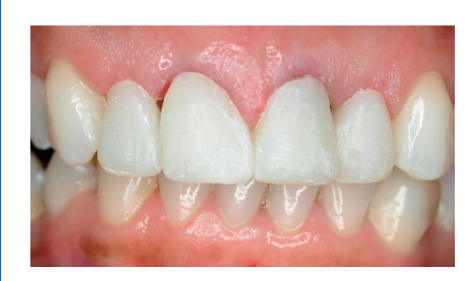
Before: Rough surface of an anterior temporary

Easy Glaze. The temporary additionally receives protection from discoloration. The colonisation of plaque on the temporary is also reduced due to the extremely smooth surface.