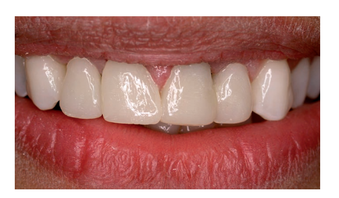
After: Tooth-like shine of the temporary without high gloss polishing